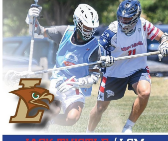
IACK THISTLE / LSM Georgetown Prep - 2020